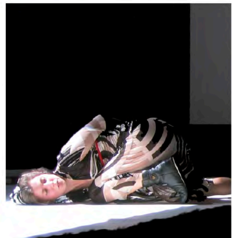
→ back to front ← / concept and performance: Mariella Greil