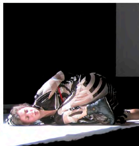
→ back to front ← / concept and performance: Mariella Greil